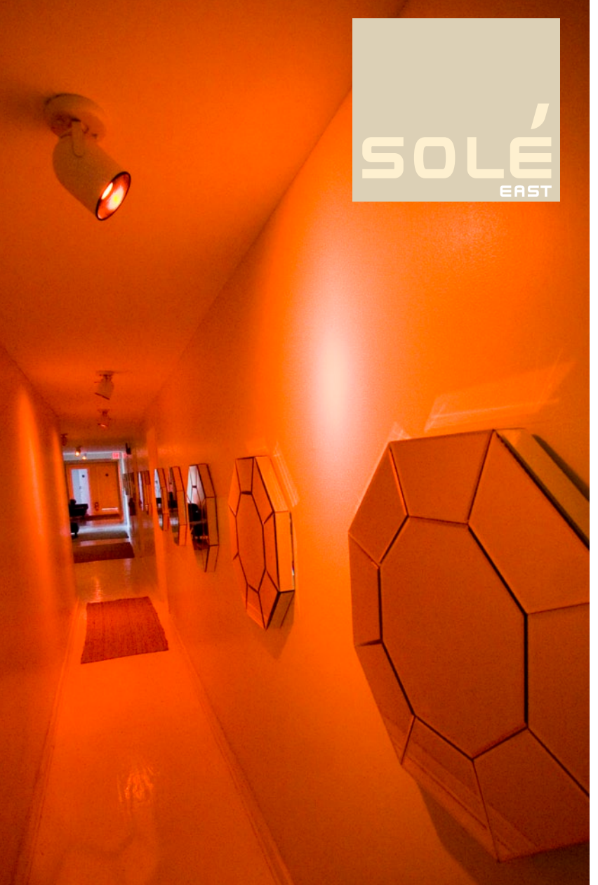
COZY, CHIC STANDARD ROOMS AT SOLE EAST (1 KING OR 2 DOUBLE BEDS)